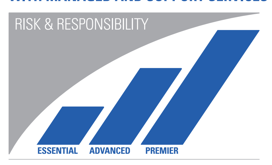
ENSURE CONTINUITY • ENHANCE PRODUCTIVITY • REDUCE RISK.